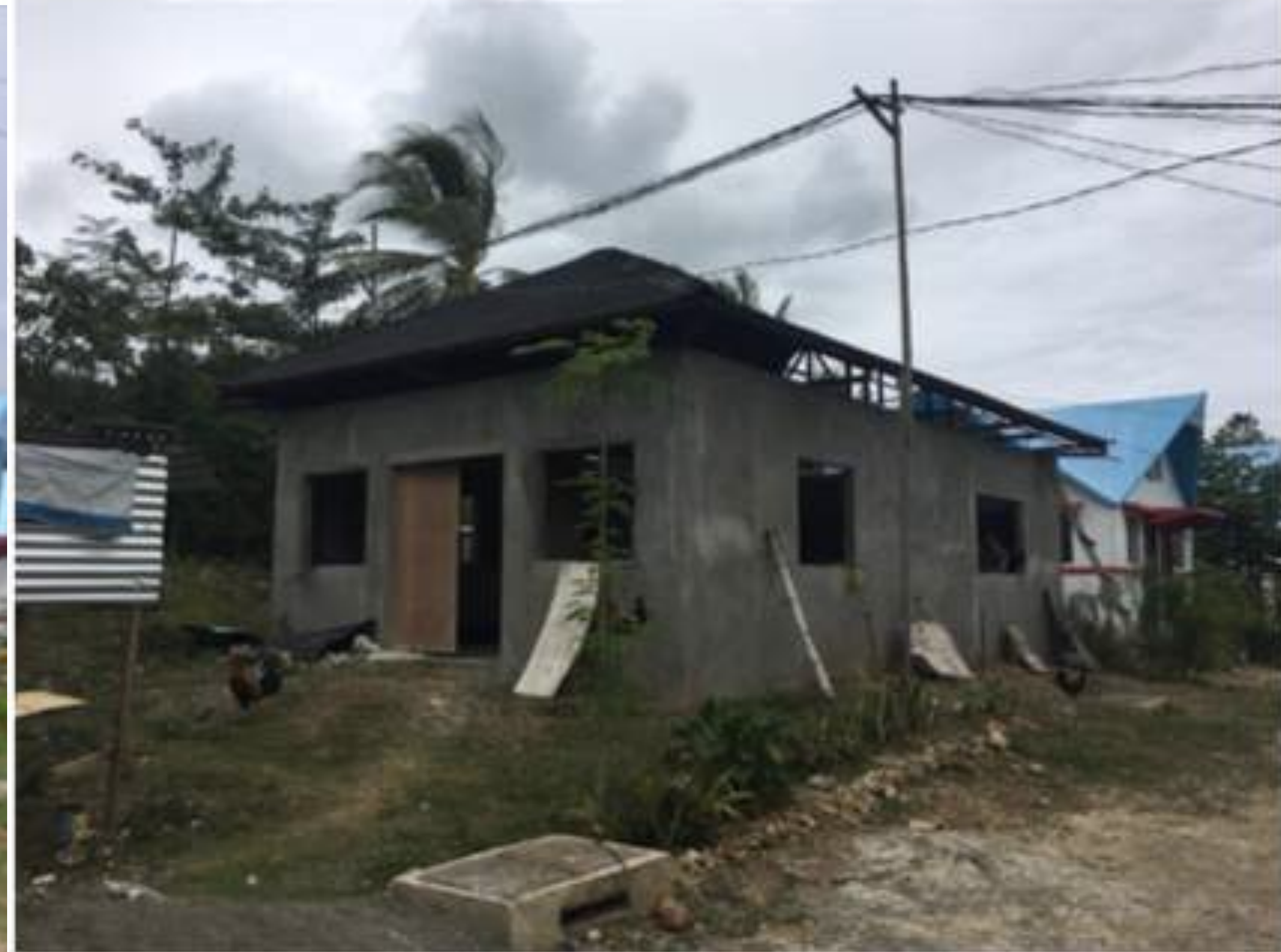
Completion of the roof, January 2019