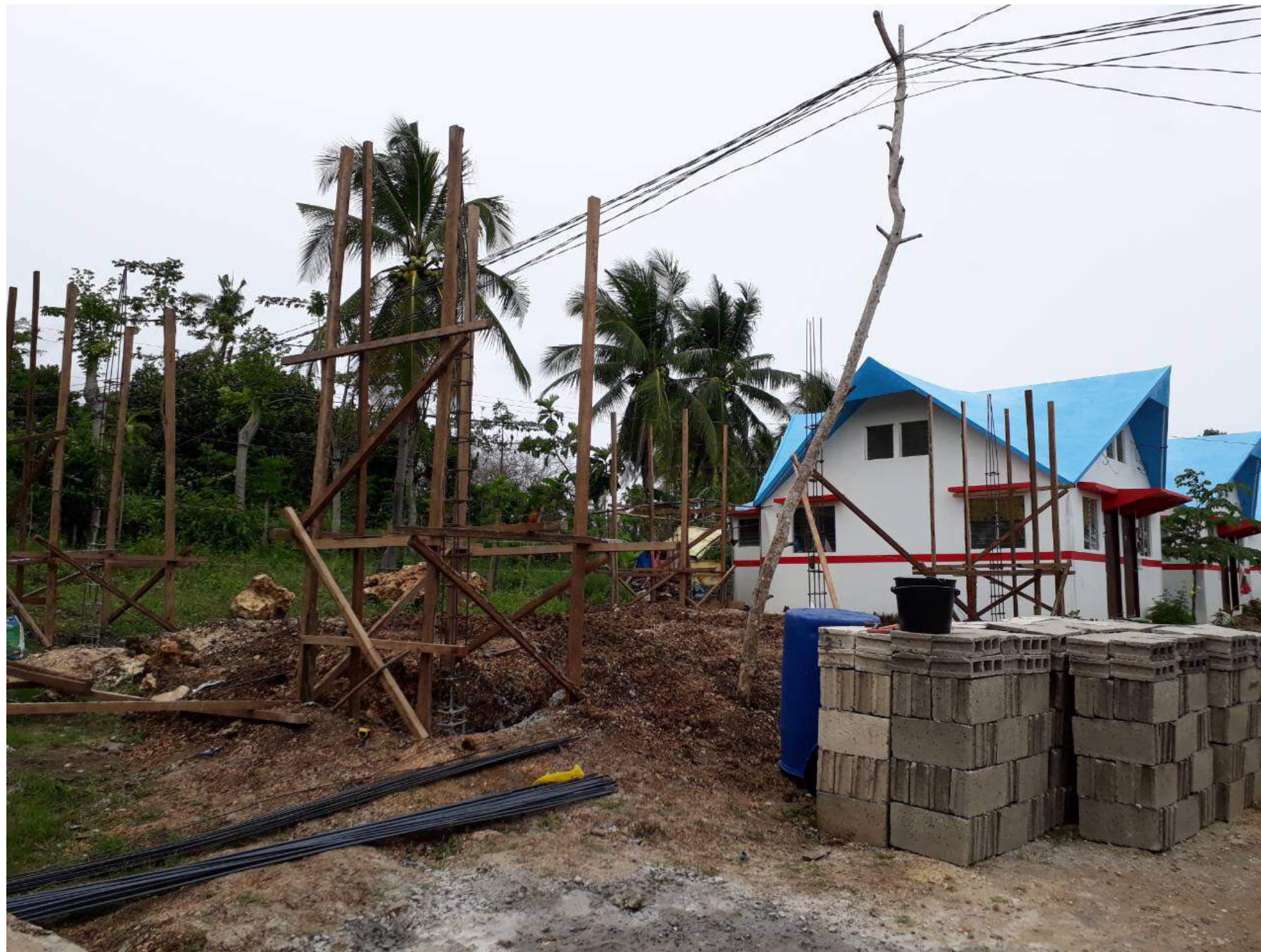
Start of the construction, January 2018