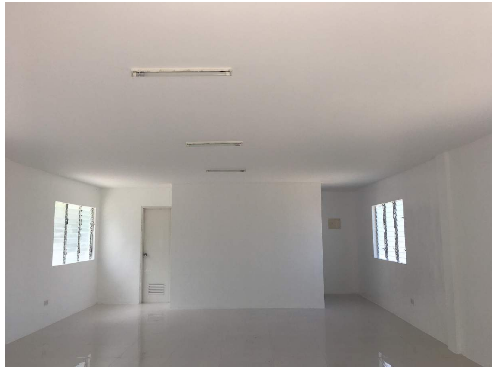
MPC completed as of February 2019