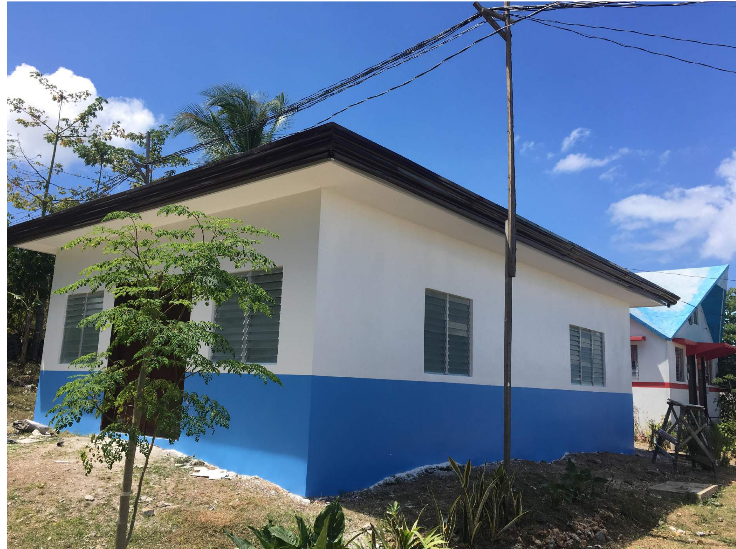
MPC completed as of February 2019