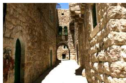
City of Hebron – Selected Images