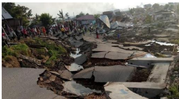
Previous photo , Tsunami in Palu by AFPJewel Samad (2018). Left photo , Street damaged by the disaster in Palu by Antara (2018)