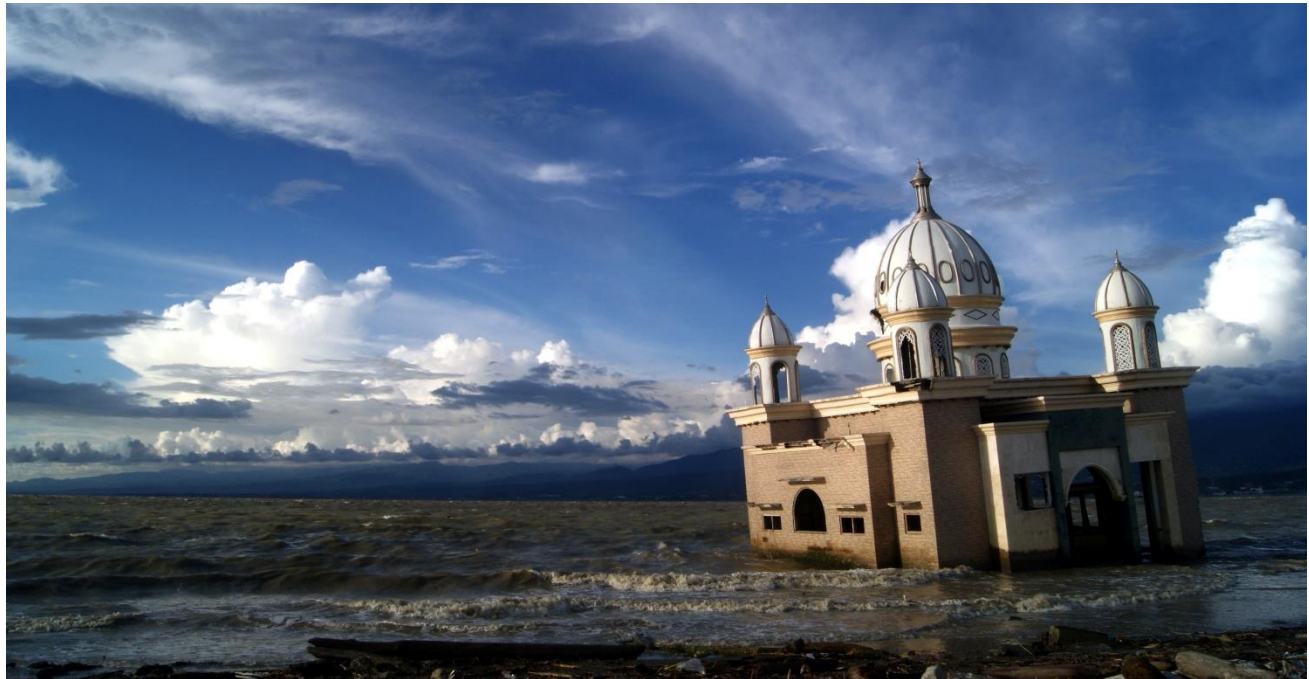
Picture Above , A floating mosque collapsed due to the tsunami (2018).