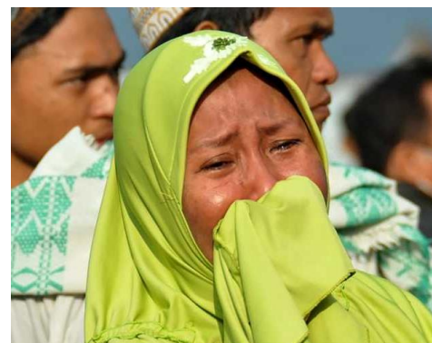
Left Picture , Situation after tsunami in Palu by New York Post (2018)